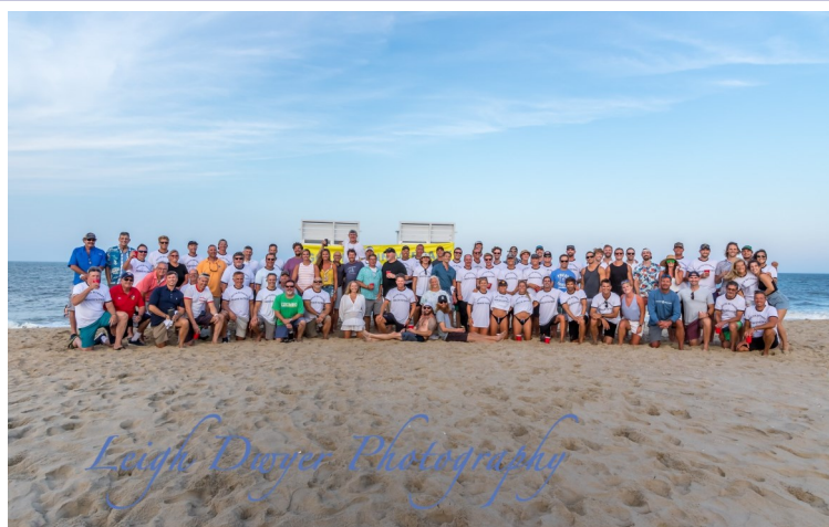
Happy 50th Anniversary to the South Bethany Beach Patrol