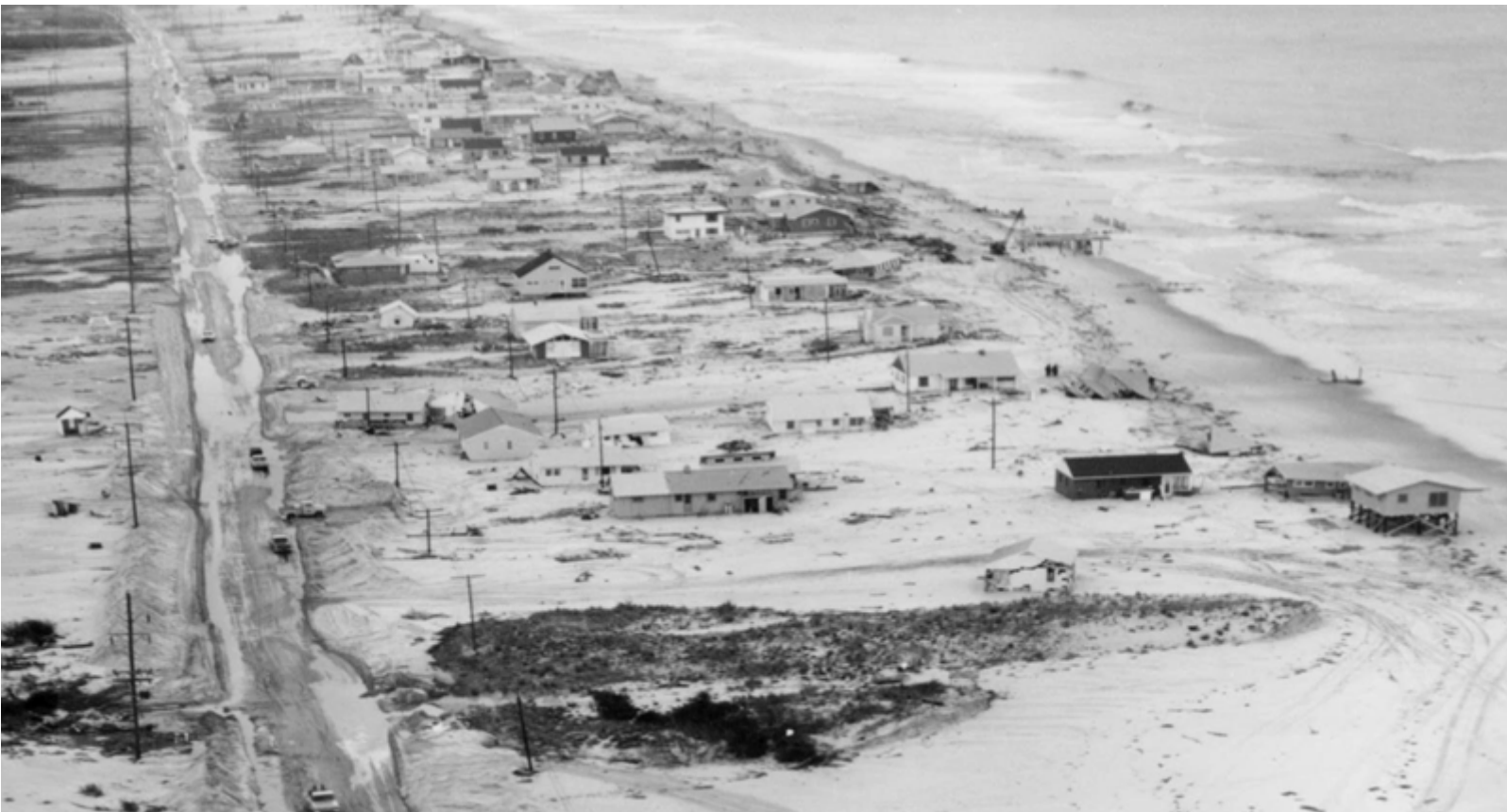
South Bethany after March, 1962 Nor'easter, Aerial Photo from DeIDOT