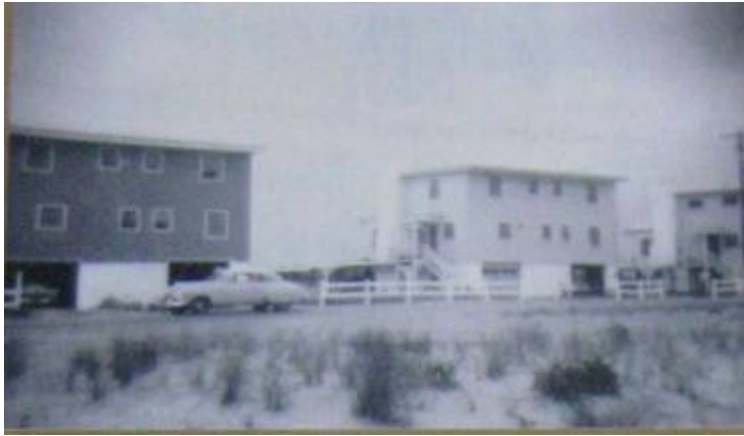
Ocean Drive before 1962