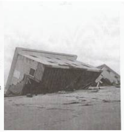
Ocean Drive after March, 1962 Nor'easter