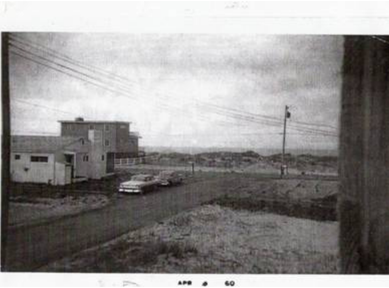
April 1960 , 1 N. 5 th St. is in the foreground, 502 N. Ocean Dr. is in the Background.