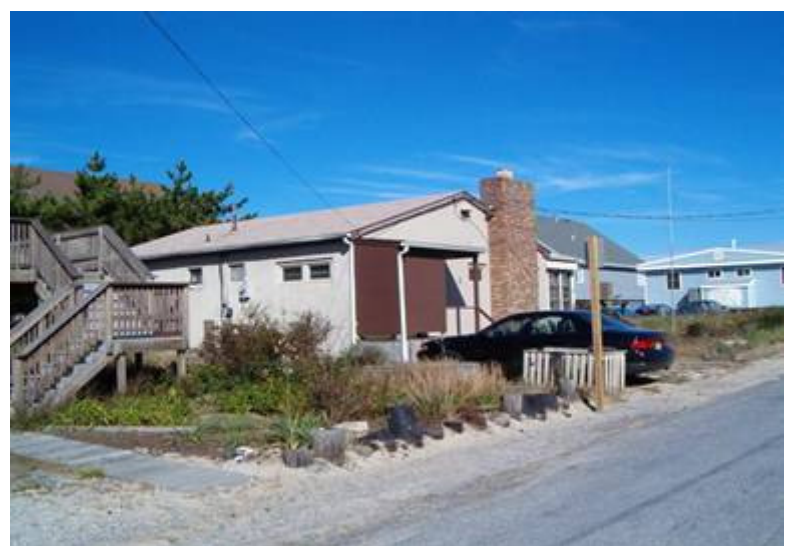
1 N. 5 th St. was still there in the summer of 2003 . It has since been torn down and a new house is in its place.