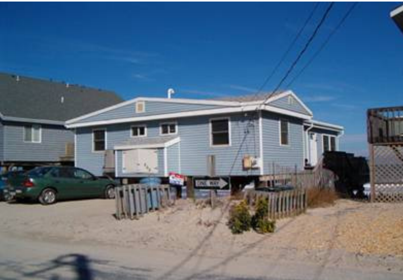
The house currently at 502 N. Ocean Dr. is not quite as large as the house that was there before the 1962 Nor'easter